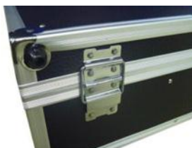
Reinforce Construction Hinges and Corner Protector

At the end of the course, the student uses the step-by-step illustrate destructions in the Experiment Manual to disassemble the trainer and prepare it for the next class